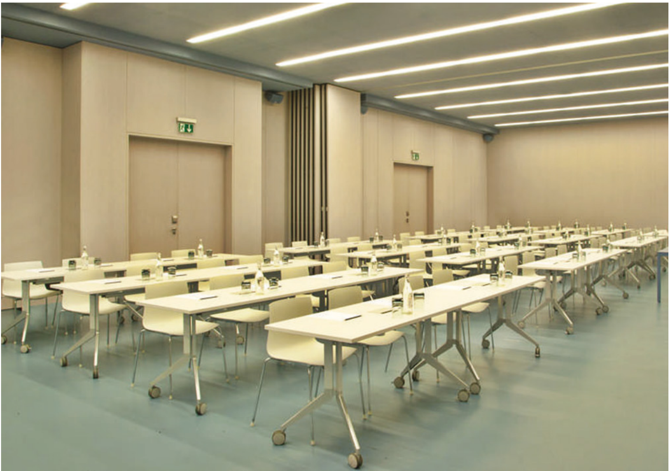
Room 2 + Room 3